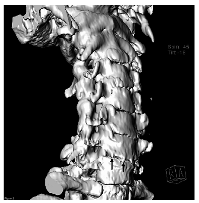
Figure 2. Three-dimension computed tomography reconstruction of bony structures of the cervical spine. Black arrows indicate osteophytes of the vertebral body margins

changes, osteophytes of the vertebral body margins, and intervertebral foramens narrowing of the cervical spine were determined. The level of statistical significance was set at p < 0.05.