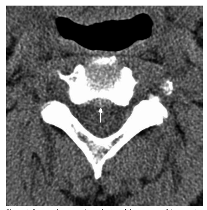
Figure 1. Computed tomography evaluation of the presence of degenerative changes of intervertebral discs. White arrow indicates intervertebral disc herniation